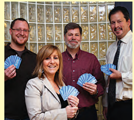
NEWPRO Representatives present TJX Gift Cards to staff at The Home For Little Wanderers.