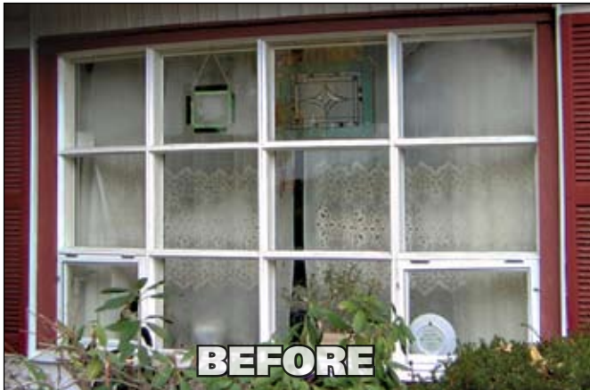
Before: Drafty, old, single pane window. Not very aesthetically pleasing bow window.