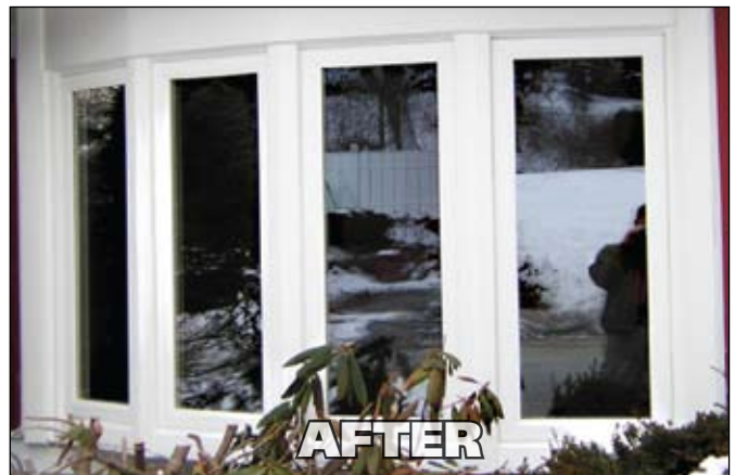
After: Sleek, new, energy saving triple pane window from NEWPRO, adding curb appeal and cost efficiency to your home.

Nobody will give your home curb appeal like NEWPRO! You can count on us to for the high quality windows we've always been famous for, our endless product style choices, and of course, our energy-efficient products that will save you BIG on your home's energy bills!