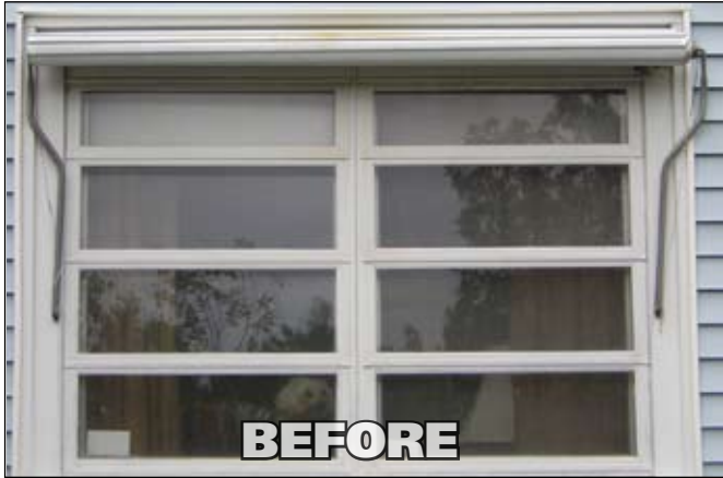
Before: Old, Drafty Windows

You've heard it before, the old saying "A picture is worth a thousand words". Here at NEWPRO, we believe it is true! Just take a look at some of these before and after photos of homes that benefitted from a NEWPRO transformation.