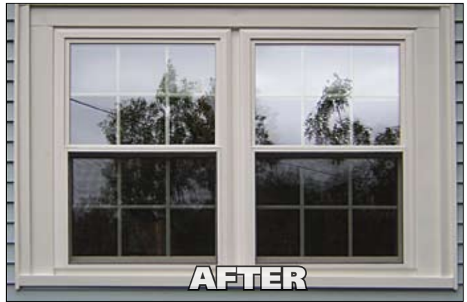
After: Brand new energy efficient double hung windows from NEWPRO!