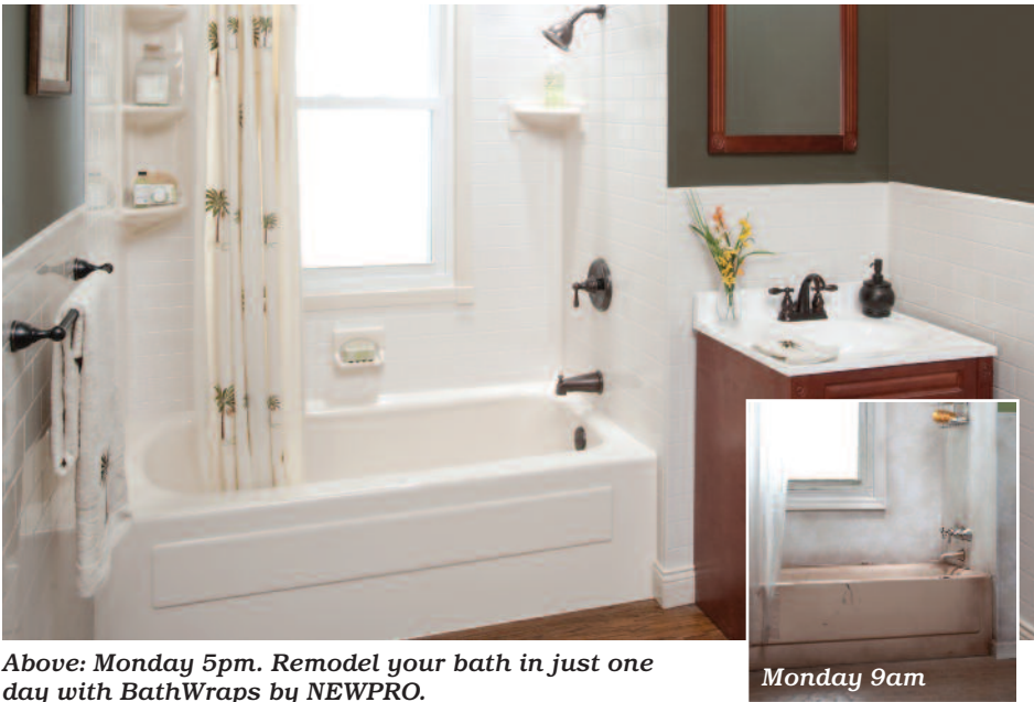
Above: Monday 5pm. Remodel your bath in just one day with BathWraps by NEWPRO.