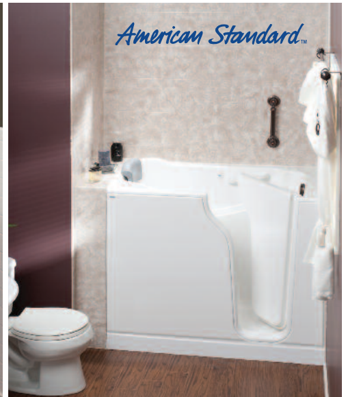
Replace your bath with luxurious jetted walk-in tub.